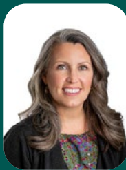
Knickolle Pitcher Commissioner