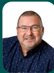
Tim Shea Commissioner