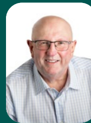
Dwight Giddens Commissioner